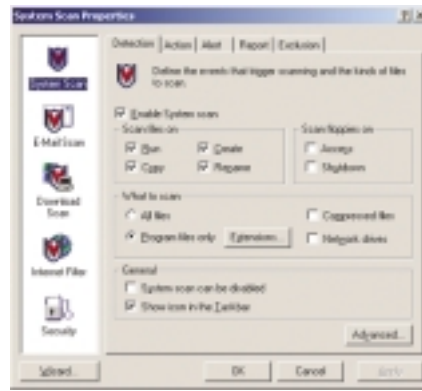
VirusScan's comprehensive protection blocks all points of entry on the desktop

Every desktop on the network represents several vectors of infection, or ways for viruses to enter the network. Floppy disks, CDs burned at home, personal email accounts, and PDAs are just a few of the routes a virus might take onto the network. That's why comprehensive, manageable desktop virus protection is essential. VirusScan is the protection of choice for desktops. Its tight integration with McAfee's ePolicy Orchestrator management console makes it one of the most manageable desktop anti-virus solution on the market today. And a host of installation and customization features make it a favorite of enterprise customers.